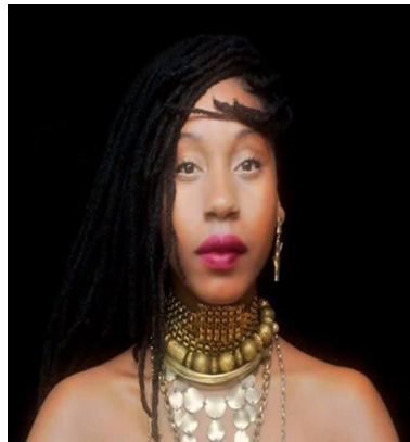
Queen Godls Spoken Word