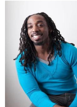
"Rasaan Talu" Green West African Drum