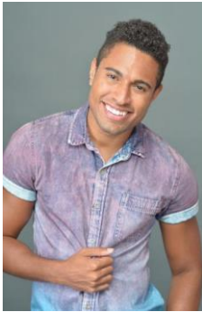
Lee Gumbs Contemporary Dance